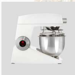
Pure white - with attachment drive