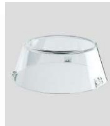
Splash guard and lid