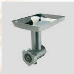
Pure mincer, stainless steel, 62 mm