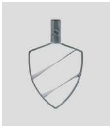
Beater, stainless steel