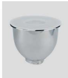
Bowl, stainless steel