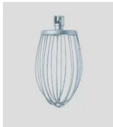
Whip, stainless steel