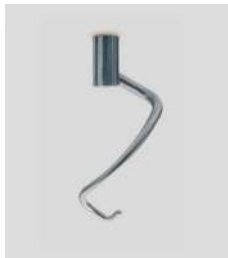
Hook, stainless steel