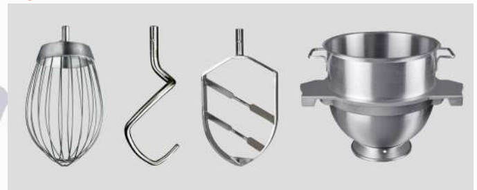
Whip, hook, beater and bowl 60/30 liter in stainless steel