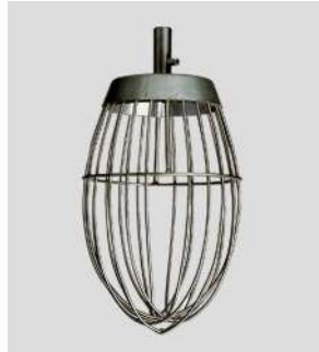
Whip with reinforcement