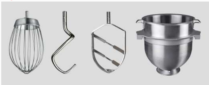
Whip, hook, beater and bowl 60 liter in stainless steel.