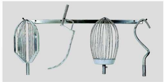
Tool rack, 127 cm