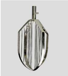
Wing whip, stainless steel