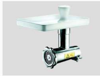
Meat mincer, 70 mm