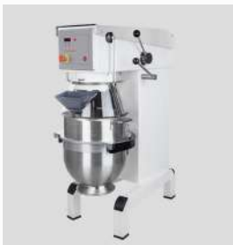
White, powder coated