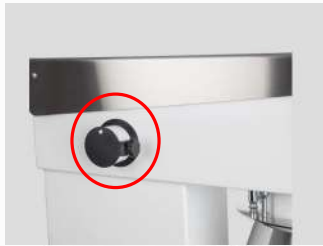
Attachment drive for meat mincer and vegetable cutter