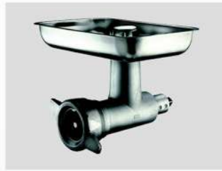
Meat mincer, 82 mm