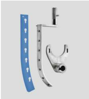
Automatic scraper in stainless steel. 40L and 40/20L