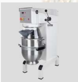
Pizza version, white, powder coated