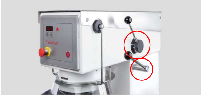
VL-1 - Manual speed regulation and manual bowl lowering