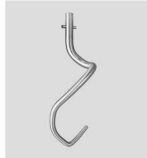
Double pinned hook for pizza