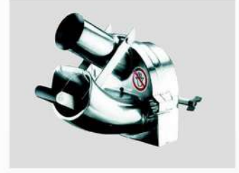
Vegetable cutter GR20