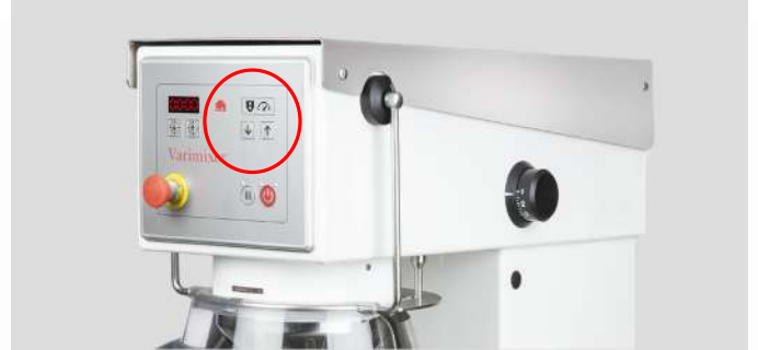
VL-1S - Automatic speed regulation and automatic bowl lowering