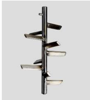
Power mixer, stainless steel