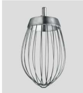
Whip with thinner wires, stainless steel