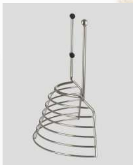
Stainless steel grid guard. Not CE-certified