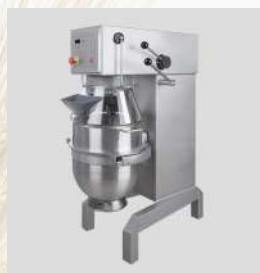
Marine version, stainless steel