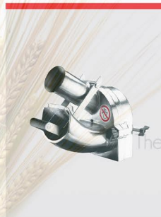
Vegetable cutter GR20