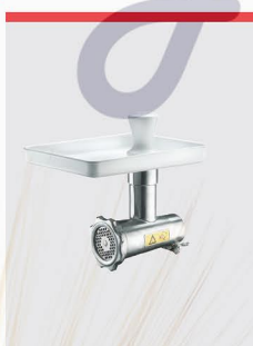
Meat mincer, 70 mm