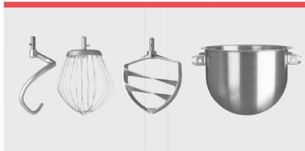
Hook, whip, beater and bowl 20 L in stainless steel.