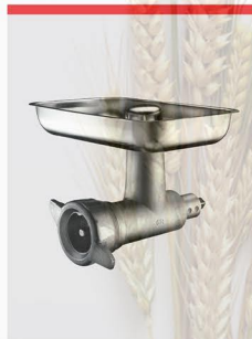
Meat mincer, 82 mm