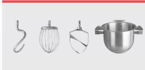
Hook, whip, beater and bowl 20/12 L in stainless steel.