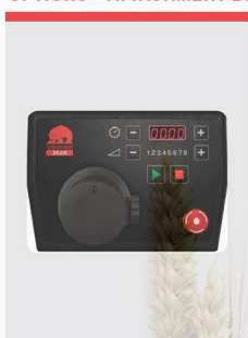
Attachment drive for meat mincer and vegetable cutter