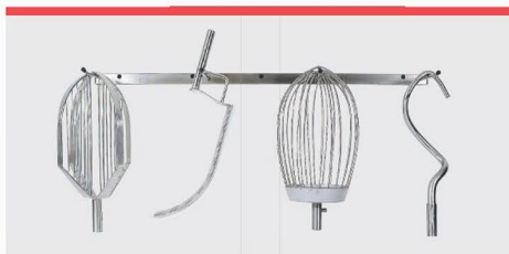
Tool rack, 91 cm