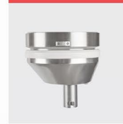
Waterproof planetary head, stainless steel, IP54