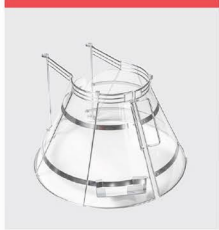
Removable safety guard in plastic. CE-certified