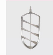
Beater with double pin, stainless steel