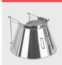
Removable splash guard in stainless steel. CE-certified