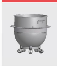
Wheels for bowl