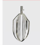
Wing whip with double pin, stainless steel