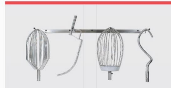
Tool rack, 127 cm