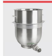
Bowl with bottom draining pipe, stainless steel