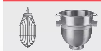
Double center reinforced whip with double pin in stainless steel and bowl 200 liter in stainless steel.