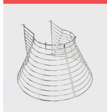
Removable safety guard in stainless steel. Not CE-certified