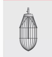
Whip with double pin, stainless steel