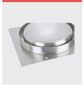
Double chimney, stainless steel, IP54