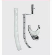
Automatic scraper, stainless steel. Nylon or teflon blade.