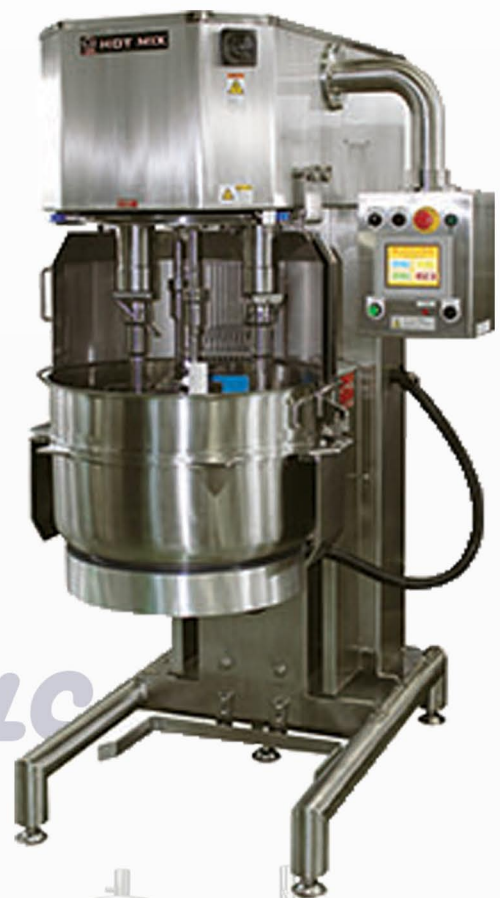
THM - 100L

These uniquely developed, heterogeneous whippers achieve fine and uniform foaming