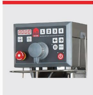
Attachment drive for meat mincer and vegetable cutter