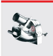
Vegetable cutter GR10