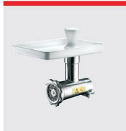
Meat mincer, 70 mm