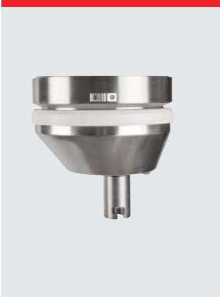
Waterproof planetary head, stainless steel, IP54