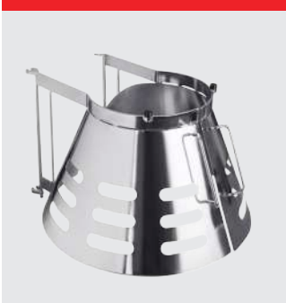
Removable safety guard in stainless steel. CE-certified