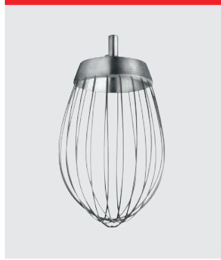
Whip with double pin, with thinner wires, stainless steel