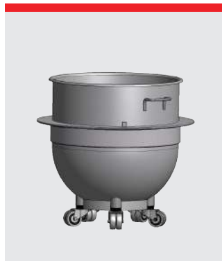
Wheels for bowl