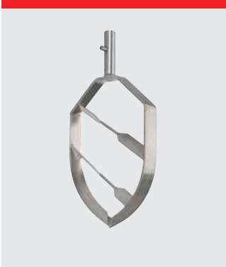
Beater with double pin, aluminium