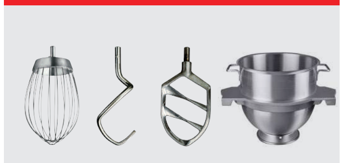
Whip, hook, beater and bowl 100/60 liter in stainless steel and Whip, hook, beater and bowl 100/40 liter in stainless steel.