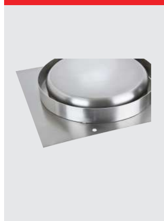
Double chimney, stainless steel, IP54