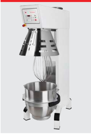
White, powder coated