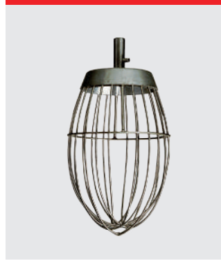
Whip with double pin, with reinforcement