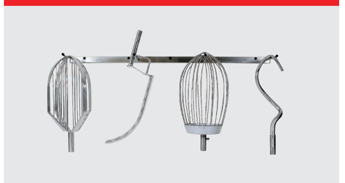
Tool rack, 127 cm