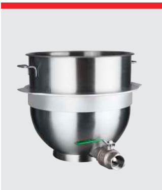
Bowl with bottom draining pipe, stainless steel