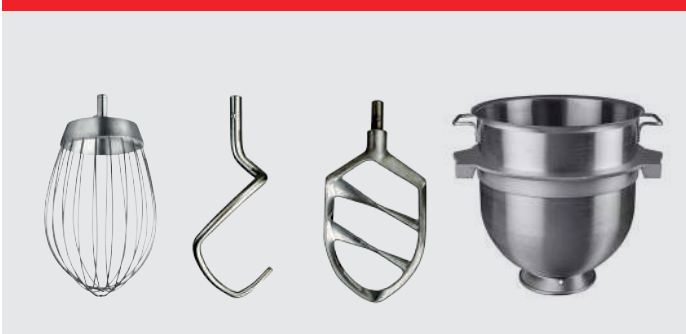
Whip with double pin, hook with double pin, beater with double pin and bowl 100 liter in stainless steel.