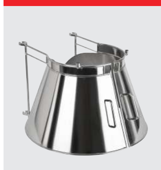
Removable splash guard in stainless steel. CE-certified