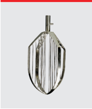
Wing whip with double pin, stainless steel