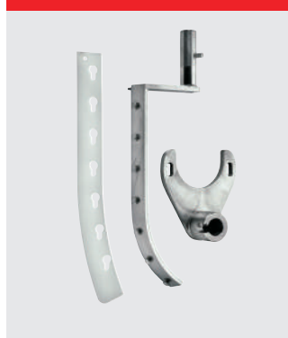
Automatic scraper, stainless steel. Nylon or teflon blade. 100L 100/60L and 100/40L.