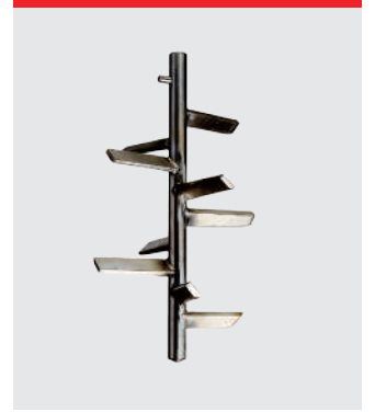
Powder mixer with double pin, stainless steel