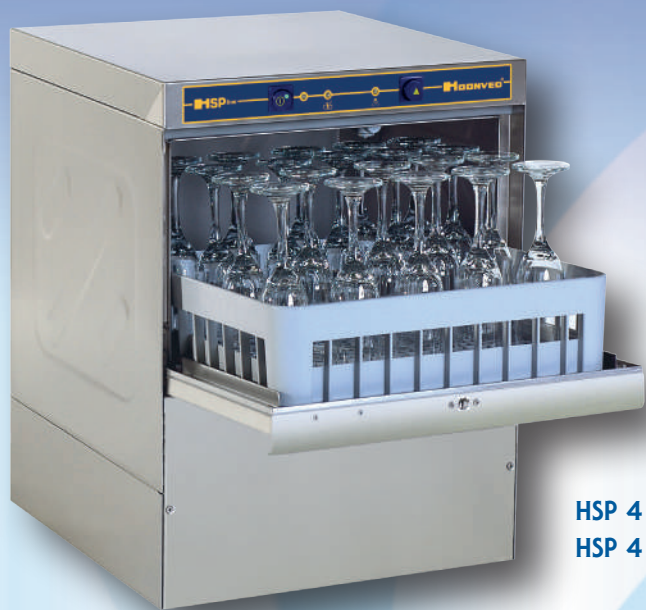
HSP 4 HSP 4 A