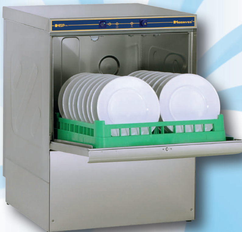
HSP 5 HSP 50