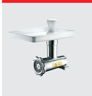
Meat mincer, 70 mm