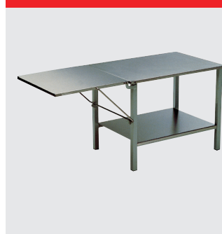
Stainless steel table for RN10