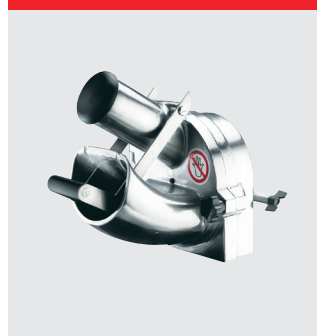
Vegetable cutter GR10