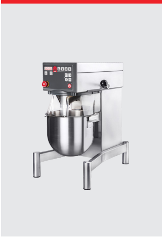
Table model, stainless steel