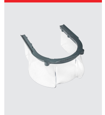
Removable magnetic safety guard. CE-certified