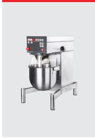
Marine version, table model