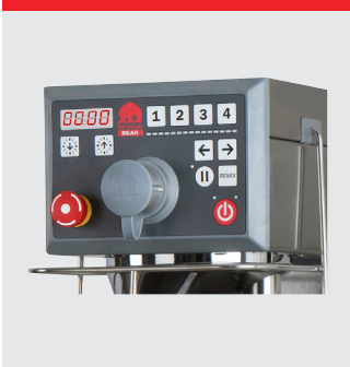
Attachment drive for meat mincer and vegetable cutter