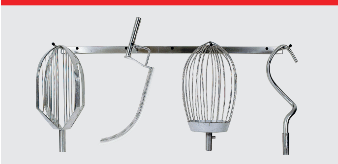
Tool rack, 91 cm